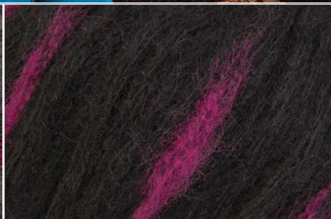
122/703 czarny / amarant