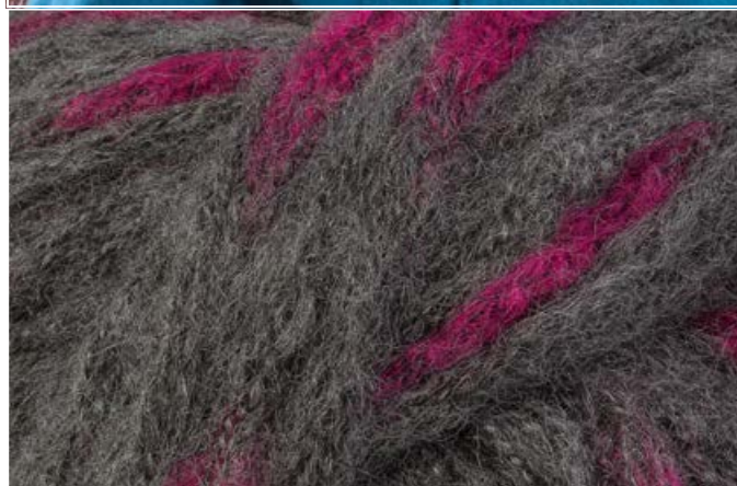
P-05 c. popiel / amarant