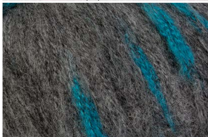
P-01 c. popiel / turkus