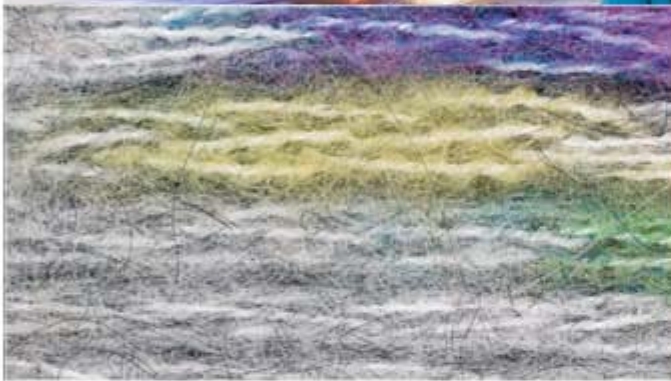
109/27 j. popiel / mix kolorów