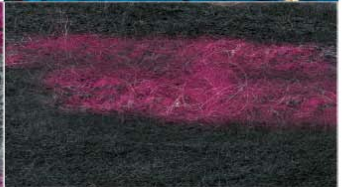
122/703 czarny / amarant