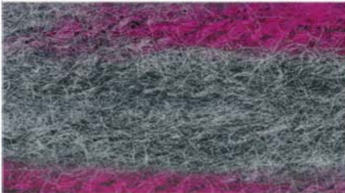
P-05 c. popiel / amarant